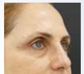
After 3 Treatments