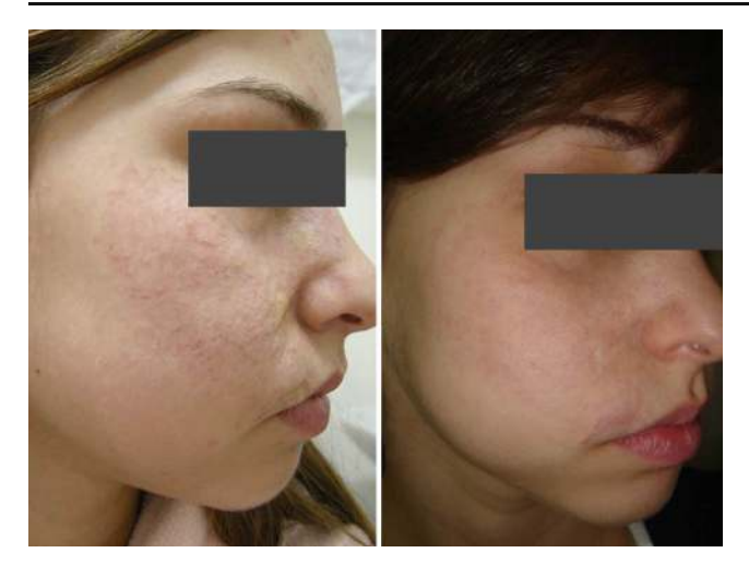
Fig. 1 A 15-year-old girl; facial scar induced by hemangioma. Before and 6 months after two treatments, parameters 25 W and 200 ms pulsed duration

cutaneous leishmaniasis, 1 was incurred during a terrorist attack, and 1 was the residua of pyoderma gangrenosum. All of the scars were mature and stable. None of the patients had undergone prior skin resurfacing. Exclusion criteria were photosensitivity, use of photosensitizing drugs, history of scarring after vaccinations, or active skin disease in the treatment area. Patients' parents were provided with a detailed description of the purpose and possible outcomes of treatment and signed informed consent forms.